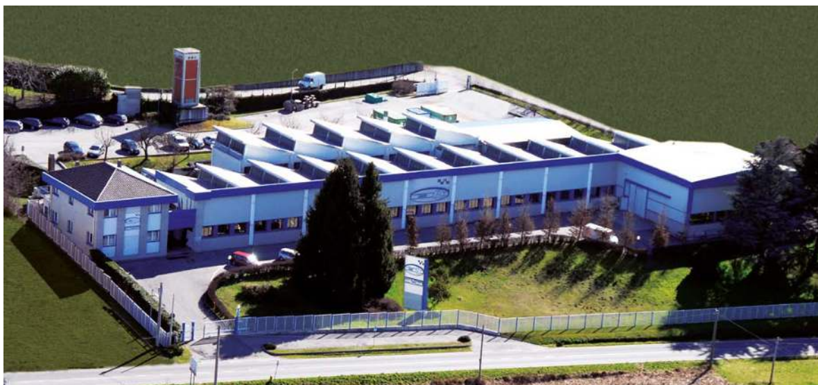
GNR Head Office and Production Site is located in Agrate Conturbia (Novara), near Lago Maggiore; 20 minutes from MALPENSA Airport.

GNR designs and produces X-Ray Diffractometers (XRD) and X-Ray Fluorescence Spectrometers (XRF) for the study of material structure and elemental composition for both academic and industrial applications.