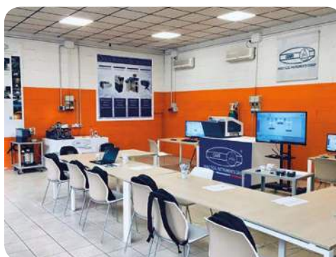
GNR periodically organizes at its facility courses and training for technicians and agents as well as seminars and demonstrations.