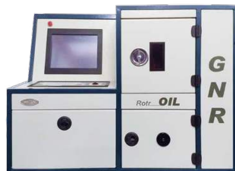
R3 Version with built-in computer