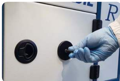
Built-in electrode sharpener