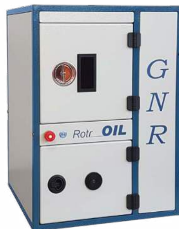
R2 Version with external computer