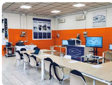
GNR periodically organizes at its facility courses and training for technicians and agents as well as seminars and demonstrations.