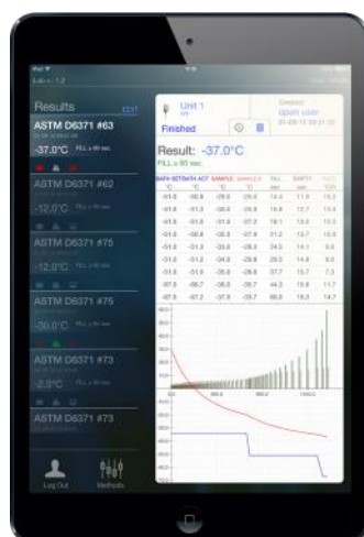
Typical CFPP result of a -37°C test.