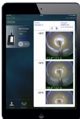
Images taken during PP test are stored in the result.