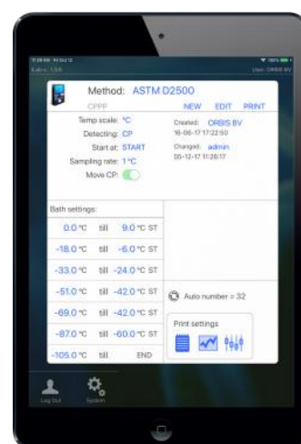
Create methods for linear cooling profiles, custom test intervals, vacuum, etc.